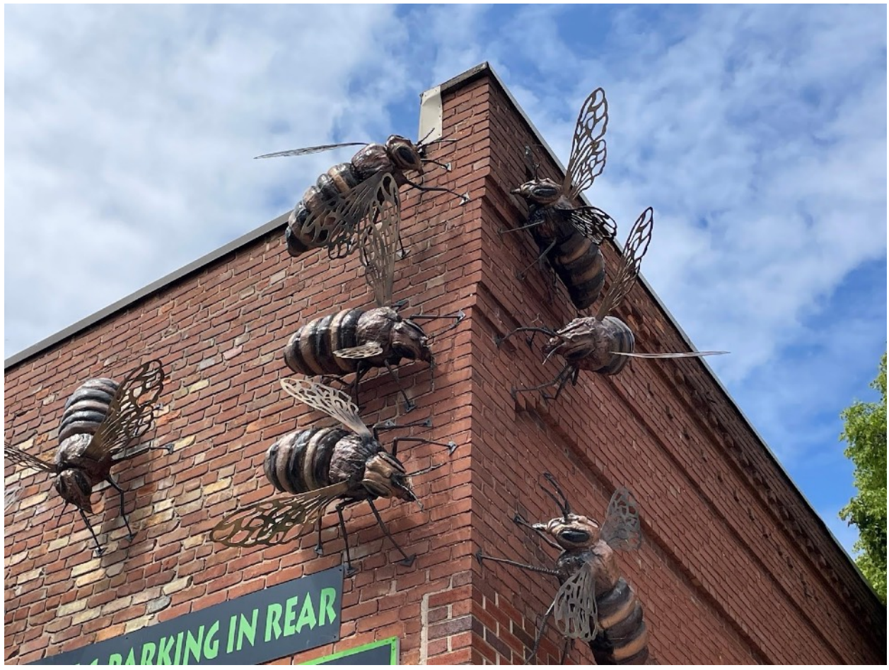
A cute building in De Pere